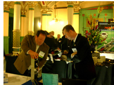
(ITSVA members mingle with state Delegates and Senators at the 2008 Legislative Reception)